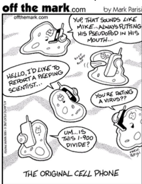
© Mark Parisi, Permission required for use.

Finish your BAT review and Note Cards and begin studying for your test early!